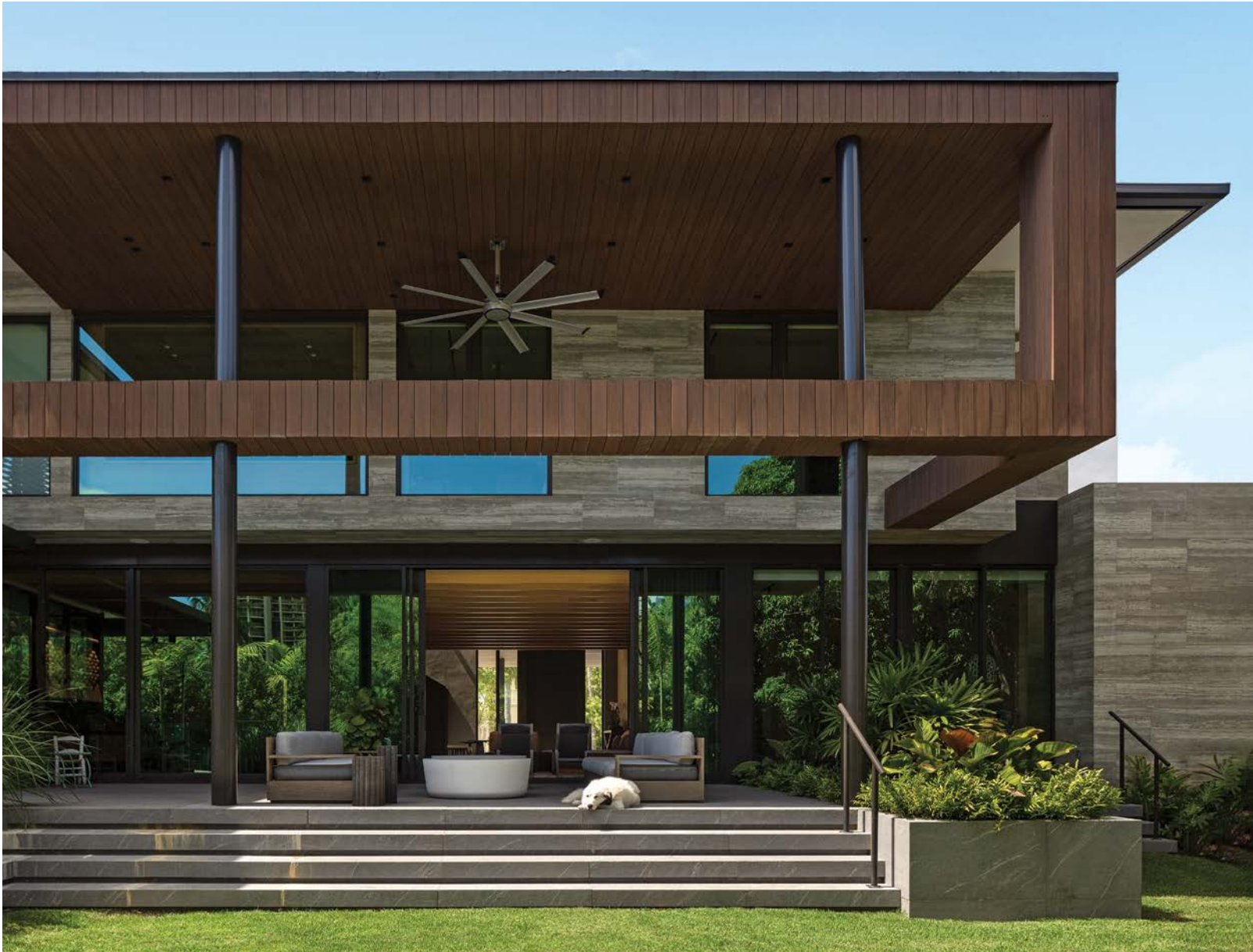
ABOVE: The family dog finds a blissfully sunny spot to lounge on the terrace steps that descend to the pool area. Bronze steel beams scaling two stories frame a massive outdoor ceiling fan. Stained wood accents and dark travertine stone were strategically selected to soften the home's exterior façade.

Table – Sulkin Askenazi Design Studio, Mexico City, Mexico Chairs – CB2, cb2.com Chandelier – Henge, henge07.com Floating wall cabinetry designed by Sulkin Askenazi Design Studio, Mexico City, Mexico, and fabricated by Emuna Construction, Miami, FL Wall art – Caralarga Showroom, Mexico City, Mexico Ceiling designed by Sulkin Askenazi Design Studio, Mexico City, Mexico, and fabricated by Emuna Construction, Miami, FL LIVING AREA Sofa grouping – Ditre Italia, ditreitalia.com Side chairs – Blu Dot, Miami, FL Cocktail table – Sulkin Askenazi Design Studio, Mexico City, Mexico Drink table – Casa Quieta Furniture, Mexico City, Mexico Floor lamp – CB2, cb2.com