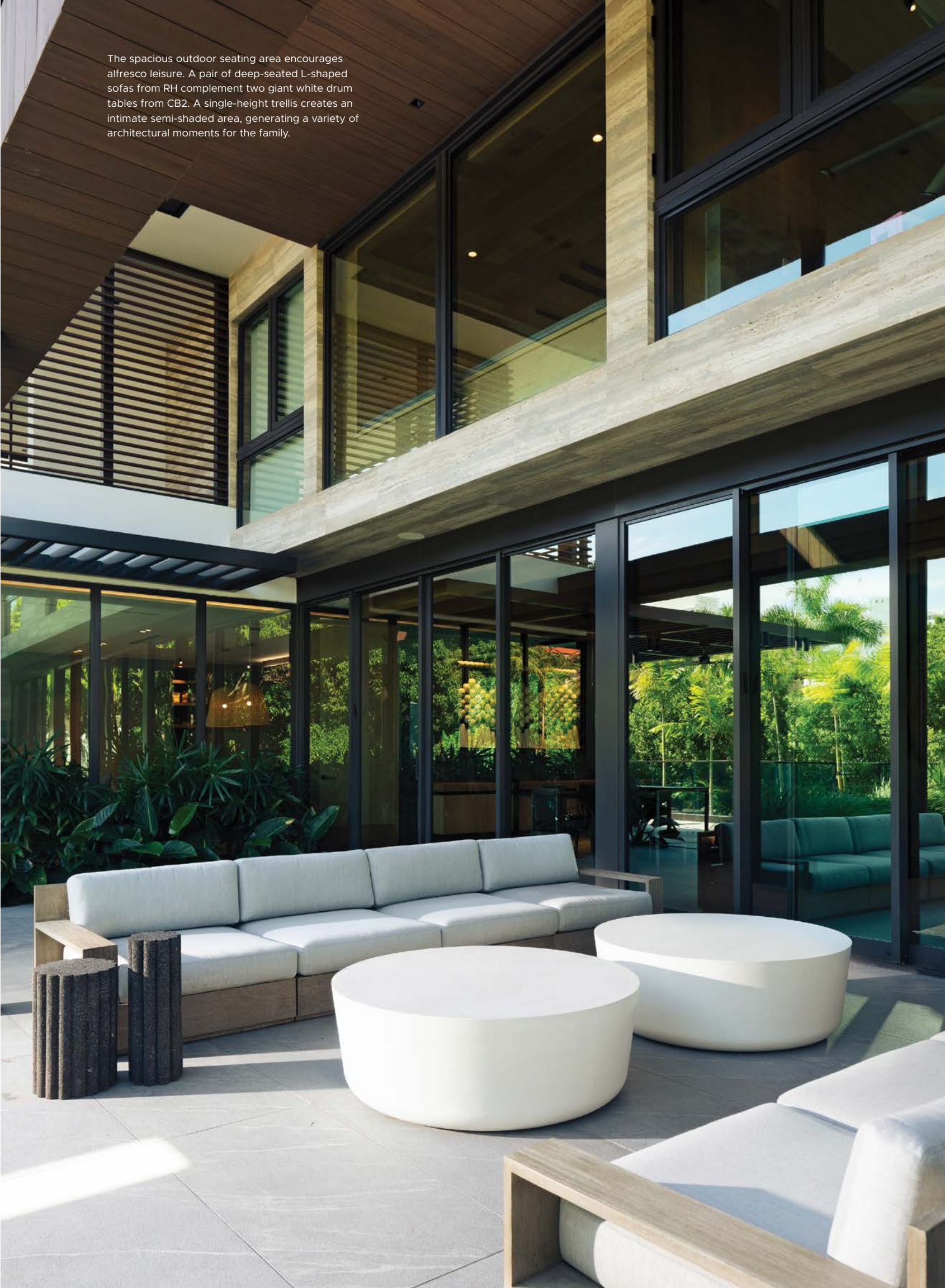
The spacious outdoor seating area encourages alfresco leisure. A pair of deep-seated L-shaped sofas from RH complement two giant white drum tables from CB2. A single-height trellis creates an intimate semi-shaded area, generating a variety of architectural moments for the family.

Stool – Blu Dot, Miami, FL PRIMARY BEDROOM Platform bed, headboard, and bench designed by Sulkin Askenazi Design Studio, Mexico City, Mexico, and fabricated by Emuna Construction, Miami, FL Wall designed by Sulkin Askenazi Design Studio, Mexico City, Mexico, and fabricated by Emuna Construction, Miami, FL Lighting – Gervasoni, gervasoni1882.com Drink table – CB2, cb2.com EXTERIOR Sofa grouping – RH, rh.com Drum tables – CB2, cb2.com Decorative side tables – Peca, Guadalajara, Mexico Ceiling fan – Big Ass Fan, bigassfan.com THROUGHOUT Builder – Emuna Construction, Miami, FL Landscape architecture – Ecopacheo, Miami, FL Millwork designed by Sulkin Askenazi Design Studio, Mexico City, Mexico